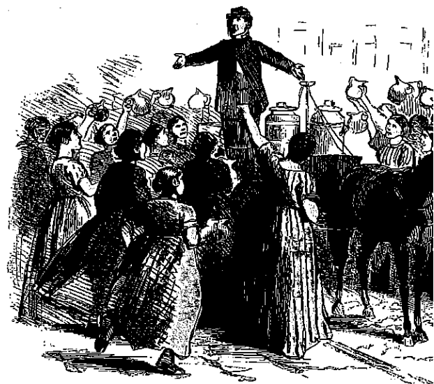
Food became scarce in many places during the Civil War. Here, women demand milk for their hungry families.